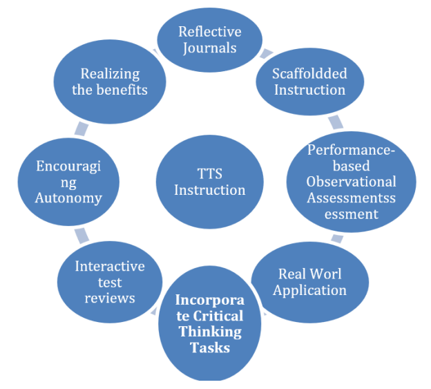
Figure 2. A proposed practical model to design TTS instruction activities in the light of the Monitor Theory.

feedback and the utilization of effective learning strategies. Building on this foundation, the current study endeavors to discern the relationship between the application of various types of feedback and teaching test-taking strategies, further contributing to our understanding of the intricate interplay between feedback and strategic learning approaches. Furthermore, Figure 2 below propose a practical model to design different TTS activities in the light of Monitor Theory.