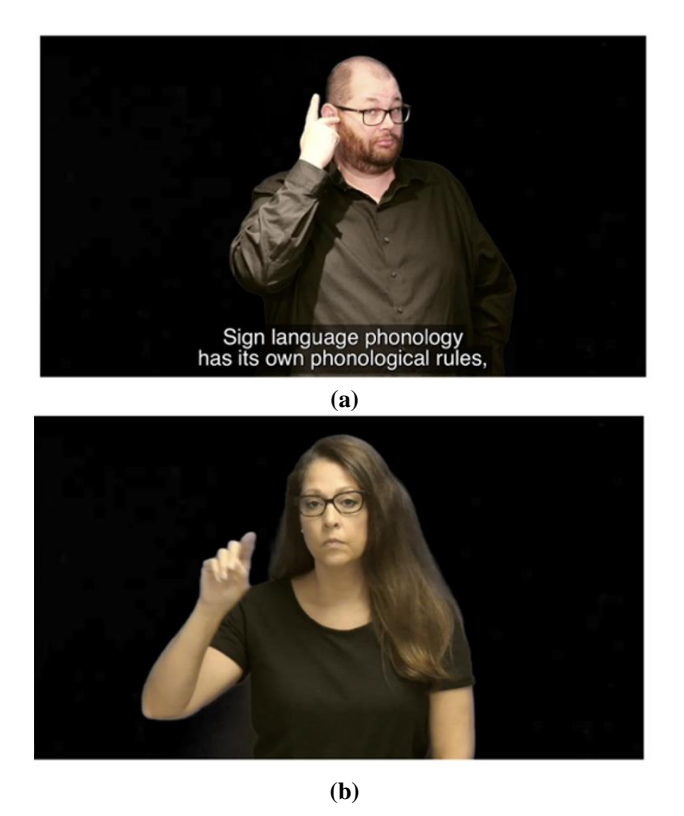
Figure 2. Fingerspelling videos, (a) an example of a fingerspelling principles page; (b) an example of a fingerspelling principles review page.