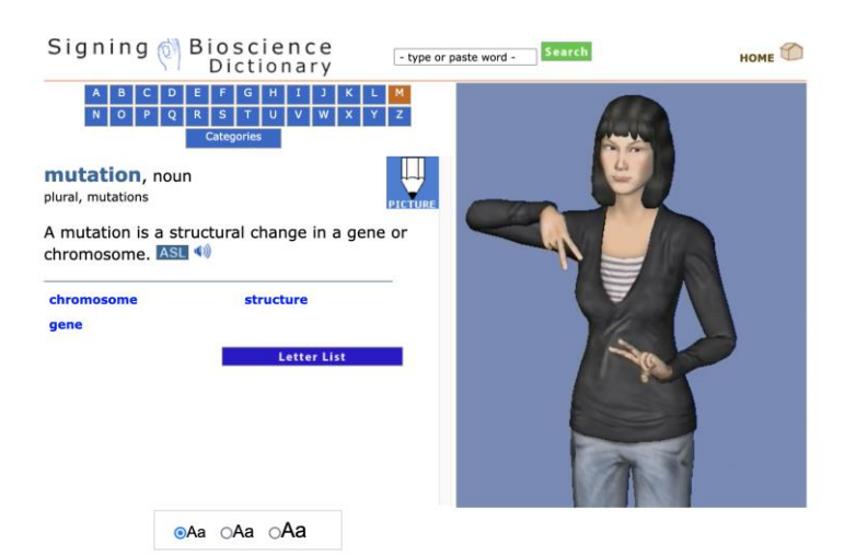
Figure 1. An example of an SBD page.