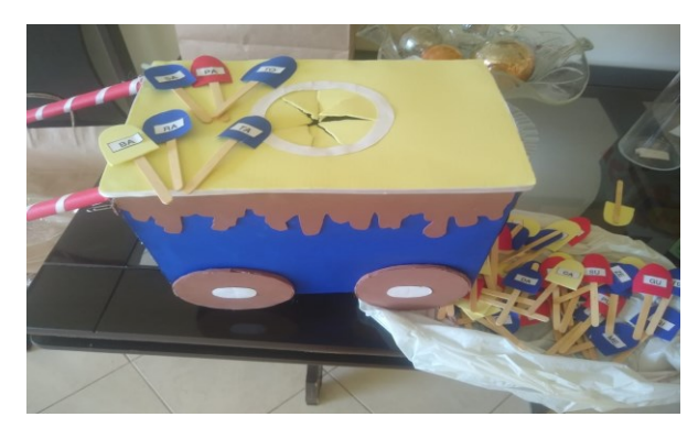
Figure 3. Syllable ice cream.

Next, two resources made for this student will be presented, considering their demands and difficulties ( Figures 3 and 4 ). The first resource aims to stimulate reading through the exposed syllables and encourage the formation of words, through the different possibilities of syllabic combinations, in order to improve reading and writing. It is worth mentioning that the aesthetic appearance of the resource, symbolizing a popsicle cart, can contribute to student motivation in learning.