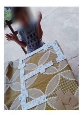
Figure 2. Dominoes of "rhymes" and activities carried out by some students.

Thus, the games are used with the class based on the identified needs. It is worth mentioning that it is necessary to allow time between the games, as the preparation of the same is done by the parents who need time for the organization and involvement of each family.