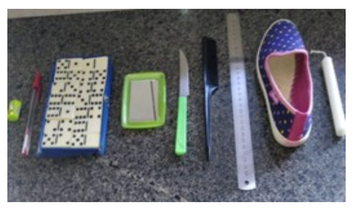
Figure 6. Activity involving alphabetical order.

Group 2 addressed the content about vowel encounters. The general objective of the activity is to recognize how vowel encounters are formed, differentiating one encounter from another, as well as the situations in which they are used in everyday school, family and social life. To learn about vowel encounters in a fun way, we use a plate, a glass of water, a napkin and a pen. The class teacher made a video, and in this activity a vowel was written on the front of the napkin and the other vowel on the back of the napkin, then this napkin was dipped in the container with water and "magically" a vowel meeting appeared on the paper. Afterwards, the child was stimulated to think of a word that had the vowel cluster that appeared on the napkin, the child should then write the word in his notebook.