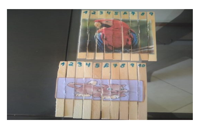
Figure 4. Stick puzzle.

The second feature ( Figure 4 ) was designed to work with numerical sequences. Through the numbering on each toothpick, the student is encouraged to place them in the correct sequence, forming an image at the end. There was a concern to place images that are part of the student's context (as defended by Freire [9]), such as the cat and the macaw, so learning becomes meaningful and is not far from the student's reality.