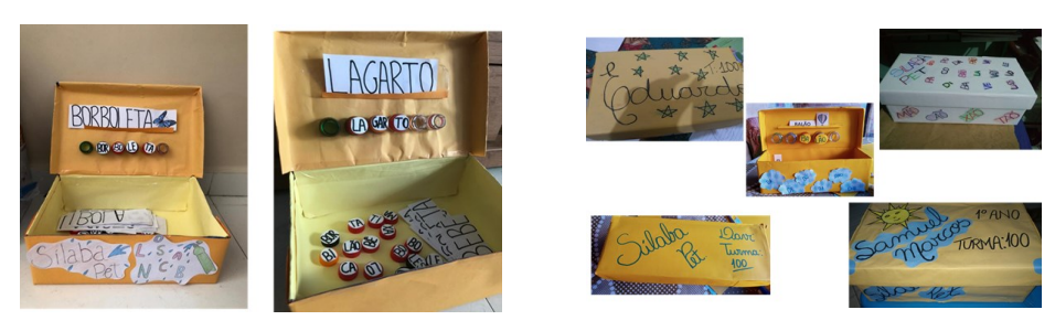
Figure 1. Pet syllable "box" and activities carried out by students.

One of the games consists of a "word formation box" using syllables ( Figure 1 ). For the assembly we used: Shoe box, caps, bottle mouth and papers to cover and decorate. The result was very positive, as it was possible to see, through videos sent by WhatsApp, the involvement of families and the joy of children when carrying out the activity. This activity will be enjoyed throughout the year, sending more words and images to update the box, along with a written activity as a form of written record.