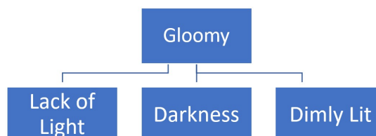
Figure 2. Concept of gloomy.

“Araby” by James Joyce, a possible example of meronymy, uses the word “gloomy” to describe the setting of the bazaar. The word “gloomy” implies a sense of darkness or lack of light, which can be associated with the bazaar’s dimly lit and somewhat desolate atmosphere (see Figure 2 ). This use of the word “gloomy” can be considered a meronym for the overall mood and atmosphere of the bazaar in the story.