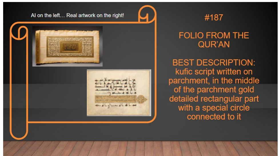
Figure 5. AI-generated student work illustrating Folio from the Qur'an.