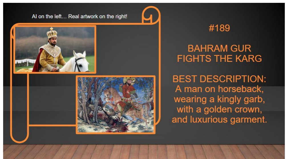
Figure 4. AI-generated student work illustrating Bahram Gur Fights the Karg.

Some instances showcased well-thought-out descriptions that, unfortunately, did not yield accurate AI-generated images. For example, Figure 5 , despite using appropriate terms like ‘kufic’ and ‘parchment’, resulted in an image that did not fully capture the described content. These outcomes indicate a disconnect between the input descriptions and the interpretation on the part of generative AI tools, highlighting the need for more precise framing in descriptions. In all, the results underscore the potential of AI tools in enhancing student understanding and descriptive skills in art history, particularly in architectural works. However, the challenges in accurately describing narrative artworks and the limitations of AI interpretation suggest areas for improvement in both AI technology and pedagogical approaches. The findings offer valuable insights into the integration of AI in art history education and its implications for teaching formal analysis.