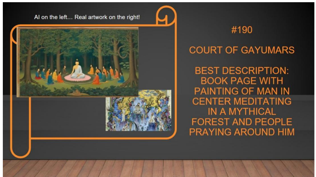
Figure 3. AI-generated student work illustrating the Court of Gayumars.